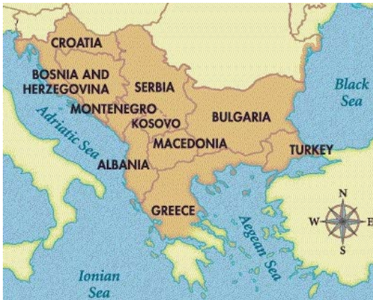
Fig. 1 Balkan region

Gwartney et al., 1996; Johnson, Holmes, Kirkpatrick, 1998): security of property rights; freedom to engage in voluntary transactions; access to sound money; freedom to engage in voluntary transactions outside the borders of a nation; restrictions in the market and freedom to compete; personal choice.