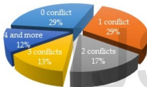
Fig. 3 Conflict occurrence in the Balkan region for the period from 1995 to 2012

Greece represents an insulated case, where we have declination of the index of economic freedom, due to the recent economic crisis situation in this country. It is obvious that during the war and conflict years in the Balkan region, in the period from 1995 to 2002 the economic freedom index was very low, even compared with the world average, but after that the stable increase is present (except for Greece). This index shows that Macedonia, a country that had severe conflict in 2001, has a steady increase in the period after the conflict and in the recent years it is a leader in the Balkan region.